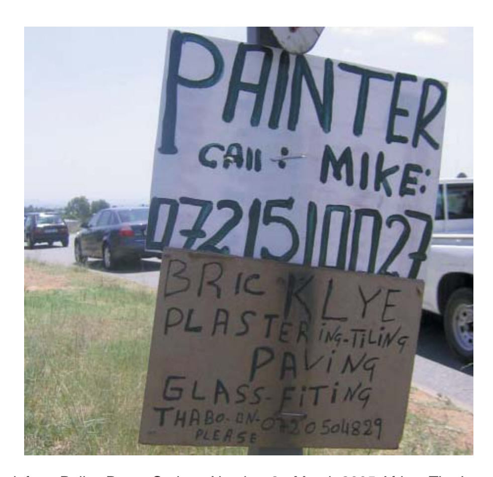
The Vodafone Policy Paper Series • Number 2 • March 2005 Africa: The Impact of Mobile Phones

whether roads or fixed-line telephones, the value of quality mobile communications is much greater.