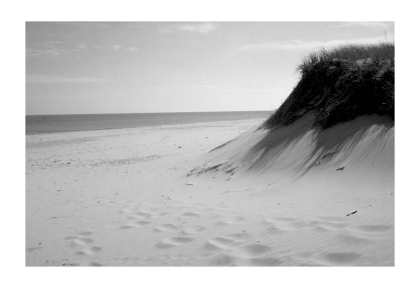
A thought from a soldier of Liberating Force 135

"We have the power to make changes. Let us all use our votes and show that we all love Jersey and want the shackles removed so that once again we can say, 'I am proud to be a Jerseyman!' I find that difficult to do the way things are.