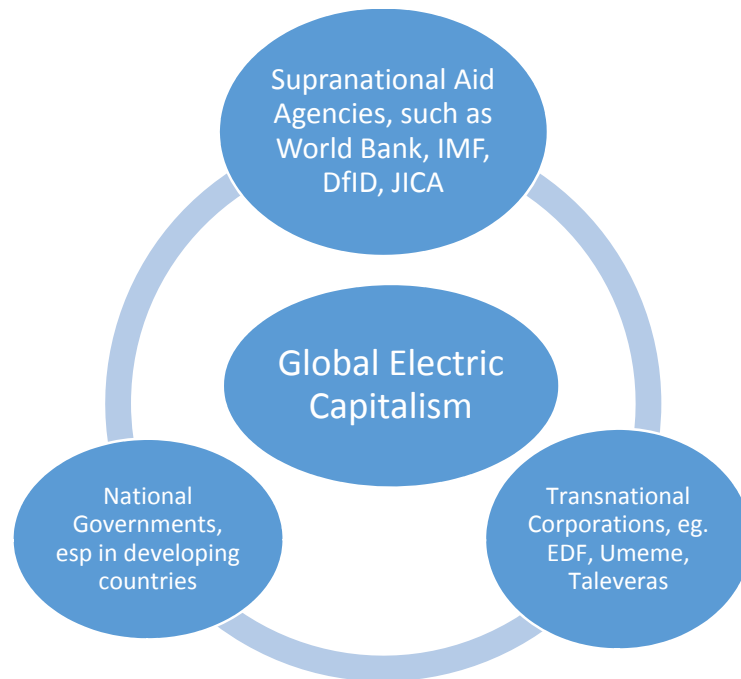
Fig.1 Framework for Conceptualising Global Electric Capitalism in Developing Countries

The above theoretical framework presents key actors in the spread of global electric capitalism in the context of developing countries. These are supranational aid agencies, transnational corporations, and national governments. The following sub sections elucidate the role of these actors in the global circuits of accumulation: